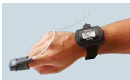
SpO 2 sensor, attached for the night

Thanks to ECG-derived respiration recording 2 , the medilogAR is able to screen for potential respiratory episodes during sleep. The optional SpO 2 sensor 2 , connected via Bluetooth, allows for additional respiratory information.