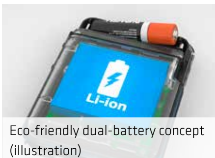
Eco-friendly dual-battery concept (illustration)

Thanks to the dual-battery concept, the patients can be screened for more than 14 days without having to see the doctor to change the batteries.